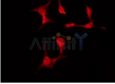
AF8340 staining SW626 by IF/ICC. The sample were fixed with PFA and permeabilized in 0.1% Triton X-100, then blocked in 10% serum for 45 minutes at 25°C. The primary Ab was diluted at 1/200 and incubated with the sample for 1 hour at 37°C. An Alexa Fluor 594 conjugated goat anti-rabbit IgG (H+L) Ab, diluted at 1/600, was used as the secondary Ab.

IMPORTANT: For western blot, incubate membrane with diluted Ab in 5% w/v milk, 1X TBS, 0.1% Tween@20 at 4°C with gentle shaking, overnight.